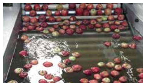
22 Latest thinking on produce hygiene