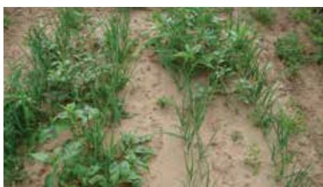
7 Treatments tested in long-term trials

Your guide to current AHDB Horticulture work and how it can help your business