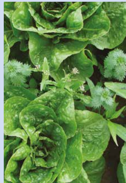
New weed control measures are a high priority for 38 of the 45 crop groups covered in the gap analysis

Weed control will remain central to the new SCEPTREplus project and there has been a good level of interest from manufacturers in offering herbicides for assessment. For instance, trials will assess options to replace linuron in carrot and parsnip. SCEPTREplus will also look at other novel weed control options such as electric weeding.