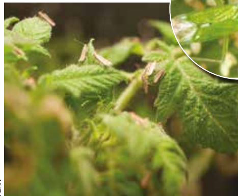
Tuta absoluta moths in a tomato crop: AHDB research devised an IPM strategy against the pest, whose caterpillars damage leaves and fruit, based on the predatory bug macrolophus (inset)

In consultation with the British Tomato Growers Association, AHDB responded by commissioning project PE 028 which identified two more products with modes of action not previously used against the moth. They have the potential to replace those now compromised by resistance but we still have to investigate how they can be integrated into the existing programme. That's currently being addressed by new work which began in 2017 (PE 032) while associated trials on product effectiveness are being undertaken in the new SCEPTREplus project.