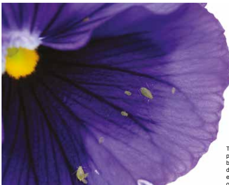
Two novel chemical products and two biopesticides tested during MOPS were effective against aphids on ornamentals

Embracing pest, disease and weed control in fruit, vegetable, protected edible