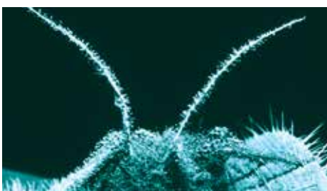
10 Ever-increasing role for biopesticides