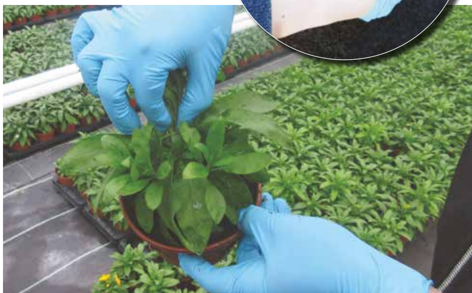
Workers will need training on the correct choice and use of gloves

An AHDB survey showed that many workers were, in fact, wearing a range of different types of gloves to keep their hands clean or to protect them from sap or thorns. AHDB discussed the results with CRD, which then conducted a study to look at the level of protection offered by specific types of 'splash-resistant single-use' (SRSU) gloves. It concluded that wearing them when handling treated plants could give adequate protection if they are selected correctly, worn properly,