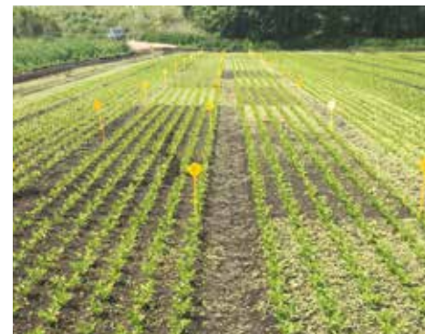
Trials of celery herbicides in the first season of SCEPTREplus are already showing some with promise

There are more than 30 priority targets and the plan for the first year includes more than 20 trials, chosen following consultation with sector panels, grower associations and using AHDB's gap