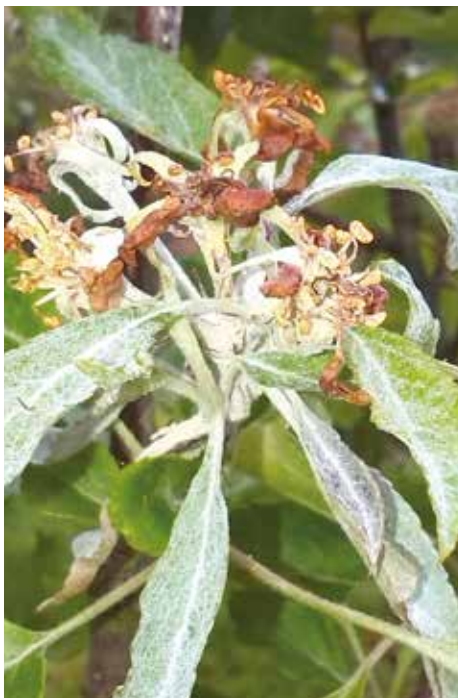
Apple mildew: trials on its control in SCEPTRE led to a new EAMU for the fungicide Talius (proquinazid)

More than 80 chemical products and 60 biopesticides were screened on fruit and vegetable crops in a series of trials to assess their effectiveness against a range of pests, diseases and weeds. For those showing most promise, AHDB worked with the manufacturers and with the Chemicals Regulation Division to obtain authorisations – either as on-label