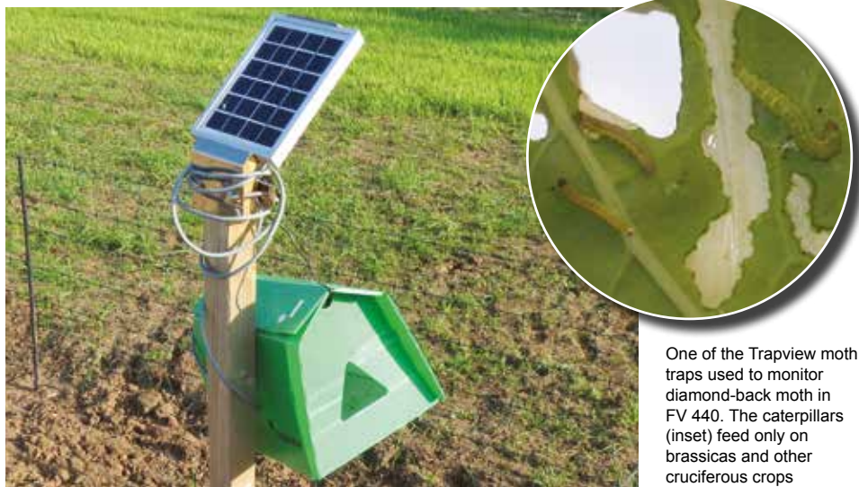
WARWICK CROP CENTRE

It was important for AHDB to get this information out to growers, because