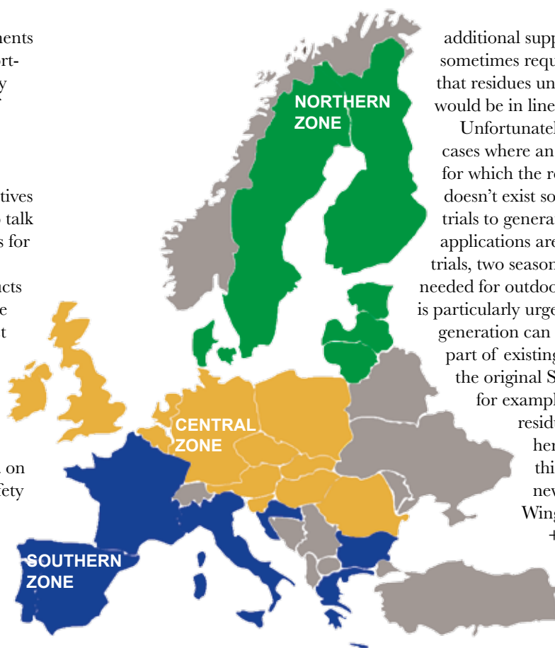
For outdoor crops, mutual recognition has to come from the same geographical zone as the UK but for protected crops it can be from anywhere in the EU

The EU has established a series of 'commodity expert groups' which are starting to work together to make residues data available. The data is generated with collaborative support from the manufacturers and through data sharing between EU member states and is particularly useful when there are